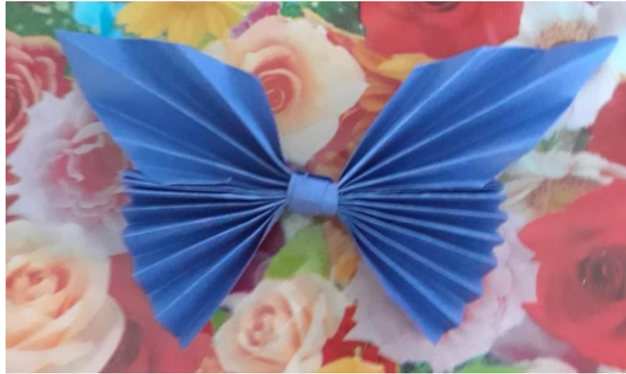
Jasmin Euceda 5A/V

Teacher reply” An origami butterfly is a beautiful spring idea. Your background is perfect. Is that gift wrap paper? Here are a few ideas to take your project to the next level! Make a few more butterfly’s in a variety of different ways. For example: If you use a colorful piece of magazine paper instead of a solid color, you may love the results as the colors will blend when you fold up your butterfly and that could look interesting with you rose background too. 2. What if you made the butterfly out of the rose paper and put it on a solid color background for the opposite contrasting effect? 3. You could even use the rose paper as both the butterfly and background resulting in be camouflaged effect. Try some of those ideas out!